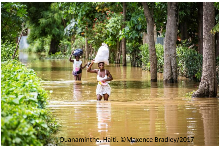
Ouanaminthe, Haiti.

Safety & Dignity for Women, Adolescent Girls & Young People