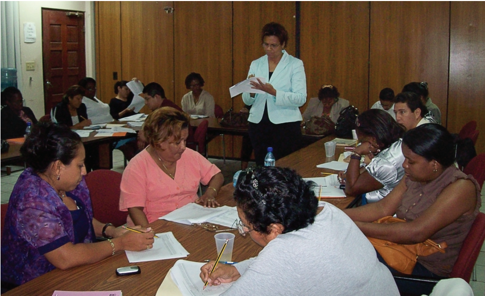
Health care personnel work together to define standards and indicators, and refine monitoring tools as part of the QI process.

impacting the services they are providing to their patients. Processes of care in maternal and neonatal health are now standardized, and monitoring has demonstrated consistent performance in preventing and reducing undesirable outcomes.