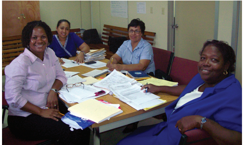
The QI Team from Stann Creek District prepares their Plan-Do-Study-Act cycles. Using QI techniques, teams were able to find locally appropriate solutions to challenges they were facing, efforts which led to a reduction in neonatal mortality.

Initial findings demonstrated that in the majority of maternal and neonatal cases reviewed, the set criteria for diagnosis and management (routine care and/or complications) was not fully met. Providers were not using AMTSL as a strategy to prevent post-partum hemorrhage (PPH). Partograph forms were available, but not being filled out. Some recently introduced midwifery forms to recollect data on care provided were causing duplication and sometimes triplicate entry in records, dispersing the information across documents, further preventing a complete understanding of the patient's current situation. The findings were shared with the teams from the health facilities as a demonstration of where there were opportunities for making improvements.